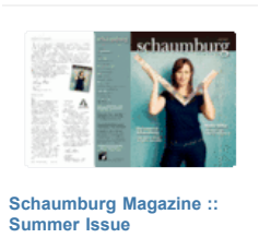
Schaumburg Magazine :: Summer Issue